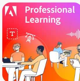
Live Virtual or In-Person Training Adobe Bootcamps & Workshops