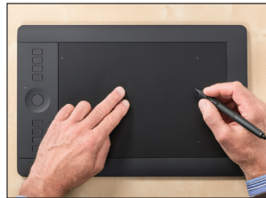
Intuos Pro in use