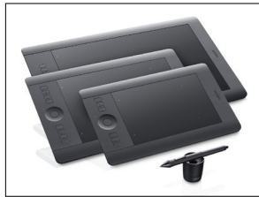
Intuos Pro sizes: S, M, L