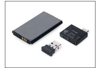
Wireless kit included