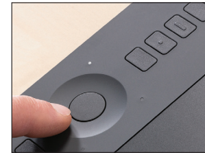
Touch Ring and ExpressKeys™